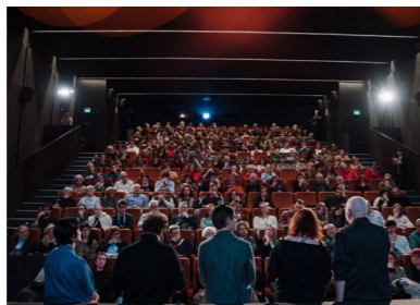
The festival's atmosphere